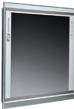
▲ Ultra-slim mechanism design