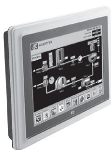
▲ Side view