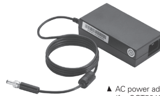
▲ AC power adapter (for GOT5840T-834-J)