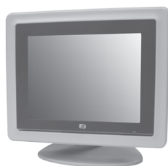
▲ Desktop stand